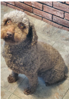
6 yr old female Spanish Water Dog

She needs a loving forever home. Lyta is in need of a new home because the owner has some health issues and is no longer able to care for her.