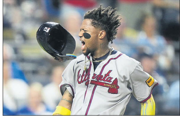
Atlanta Braves' Ronald Acuna Jr. celebrates after scoring on a three-run double hit by Austin Riley during the eighth inning of a baseball game against the Kansas City Royals, Monday, in Kansas City, Mo.

BY AVERY OSEN ASSOCIATED PRESS KANSAS CITY, Mo. — Atlanta Braves outfielder Ronald Acuña Jr. was removed from Tuesday night's loss at Kansas City with tightness in his right Achilles tendon and will be placed on the 10-day injured list. Acuña experienced the discomfort after chasing down a ball in right field. He'll be evaluated further on Wednesday. "It's an Achilles thing, it's going to take a while," manager Brian Snitker said after the Braves fell 9-6 to the Royals. "He'll go on the IL and hopefully in 10 days or so it'll clear up." Acuña said he initially