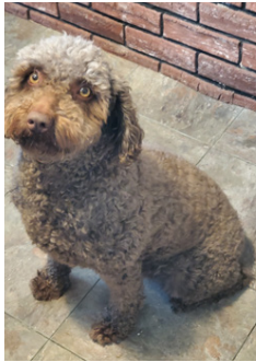
6 yr old female Spanish Water Dog

She needs a loving forever home. Lyla is in need of a new home because the owner has some health issues and is no longer able to care for her.