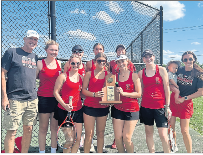
The girls' team from Bullitt East advanced to the state

After the first two rounds of the state tournament were played at four sites around the state, the KHSAA took the final 16 players and ranked the top four players from one to four. The next four players were grouped 'five through eight', this group